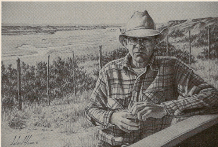
Could Have Been a Lawyer, 9 by 13-inch graphite.